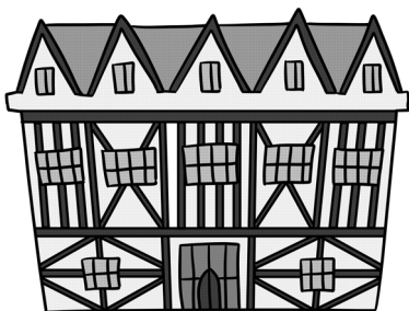
The Gatehouse at New Place as it originally looked

Candlesticks were made to carry candles but what were the candles made from?