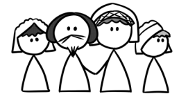
William and family

Turn around and explore the three sections of the white model of New Place: the Gatehouse, the Service Range and the Hall. There are drawers in the model. Each drawer has a title and contains various objects showing life at New Place.