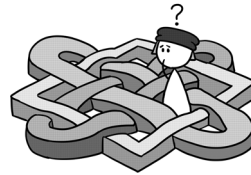
Tudor knot garden

Amazing Fact – Knot Gardens were used by wealthy people to decorate their gardens. The symmetrical patterns were made from low hedges of hyssop or thyme and the spaces were filled with herbs and flowers.